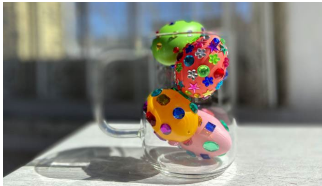
Jewel egg - decorate the eggs with stick on jewels