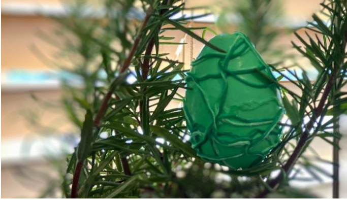
String egg - use embroidery floss and Mod Podge to create a stringy texture. Roll the egg in Mod Podge and loosely wrap the floss around