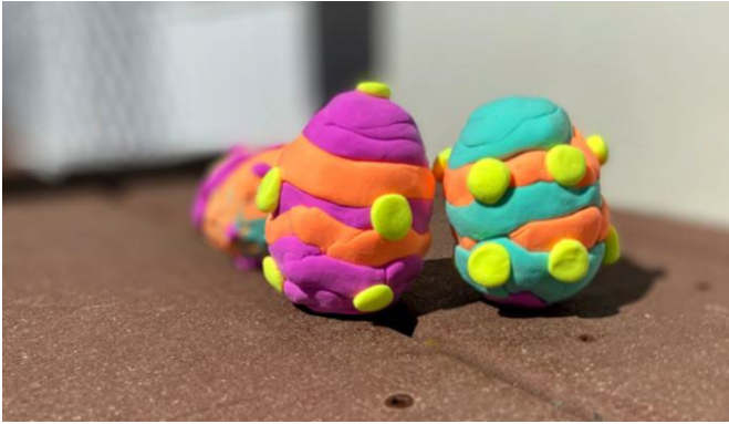
Clay egg - using foam clay, it will dry quick and let you design how you want